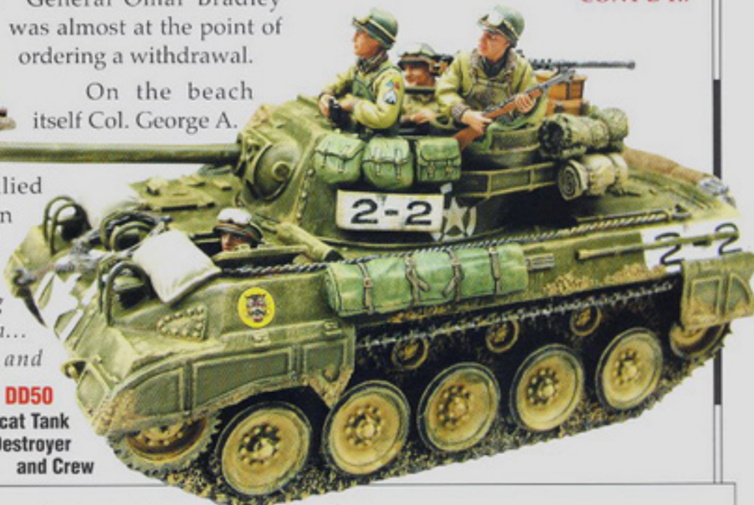
DD50 Hellcat Tank Destroyer and Crew