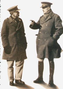
DESERT DISCOURSE Generals O'Connor (left) and Wavell discuss tactics near Bardia. Richard O'Connor (1889-1981) was a scholarly man whose imagination produced highly unconventional plans. He led his men from the front, keeping his tactical headquarters near the front line, and often reconnoitred behind enemy lines. He was captured by the Germans on one such trip in April 1941, but escaped when Italy capitulated in 1943 and fought in Normandy. He used to wear an Italian medal won in 1918.

O'Connor now pushed some of his forces deep into the desert to attack and cut off the retreating Italians at another coastal port... Beda Fomm . Time and time