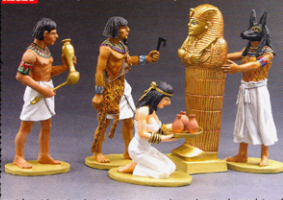
AE025 "Opening the Mouth Ceremony"