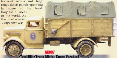
AK037 Opel Blitz Truck (Afrika Korps Version)

For a more up-to-date mode of desert transport collectors can seek out