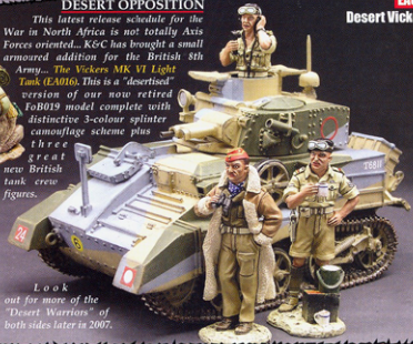
EA016 Desert Vickers

Look out for more of the "Desert Warriors" of both sides later in 2007.