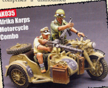
AK035 Afrika Korps Motorcycle Combo

our very latest motorcycle combo... The Afrika Korps Desert Combo ( AK035 ). This dramatic set portrays two German motorcyclists in action. In this case with the driver pointing out a target for his MG 34 firing partner. Finally, we have our long-awaited " Opel Blitz Truck " ( AK037 ) - the ubiquitous German 4-wheeled truck of WW2... in Afrika Korps paint scheme and markings. This new model boasts a fully detailed cab interior with seated driver included. In addition the vehicle's rear canvas covering can be removed allowing collectors to place seated or standing figures (as well as supplies) inside if they wish.