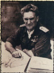
Marshal Graziani Italian C in C

The Marshall's intention was to improve his supply lines, until the cool of the Egyptian winter allowed him to advance further.