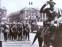
Germans marching through the streets of Paris on June 14, 1940.

The failure of the French Commander, General Maurice Gamelin, to stem the Nazi advance led to him being replaced by