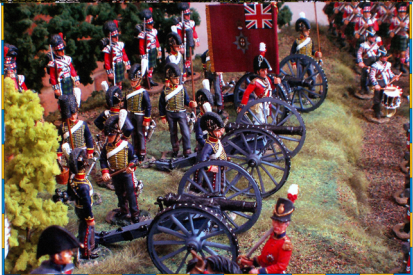
Top picture: British Infantry form up against a French attack.