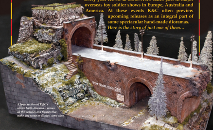
A large section of K&C's winter battle diorama... into it all the vehicles and figures that make any scene or display come alive.