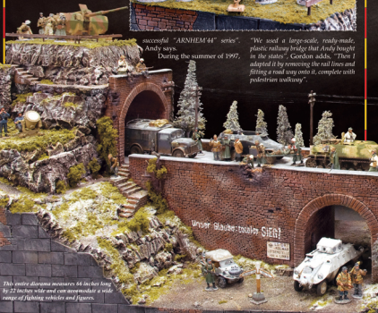
This entire diorama measures 66 inches long by 22 inches wide and can accommodate a wide range of fighting vehicles and figures.

"We used a large-scale, ready-made, plastic railway bridge that Andy bought in the states", Gordon adds, "Then I adapted it by removing the rail lines and fitting a road way onto it, complete with pedestrian walkway".