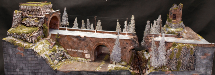
A deserted roadway through the Ardennes Forest sometime in early December 1944.

grassy surface of the plateau above the main road tunnel entrance.