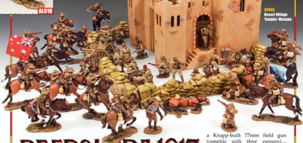
SP043 Desert Village Temple/Mosque