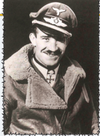
General Der Jagdflieger Galland in typical confident mood.

As one of the most famous fighting airmen of WW2 KING & COUNTRY has featured him several times alongside two of his "warbirds".