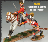
NA211 "Gordons & Greys to the Front!"

most heroic engagements of the entire battle... As a force of British cavalry (the 2nd North British Dragoons, better known as The Scots Greys) moved through the