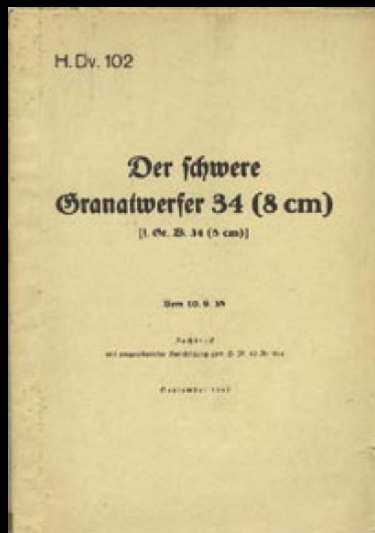
Mortar instruction pamphlet.