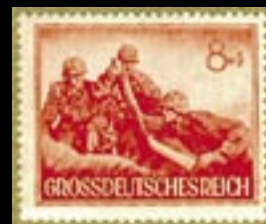
Third Reich postage stamp.

Normal mode of transporting the weapon over long distances was by horse drawn cart. The weapon could also be carried by a 3 man crew and eventually various self propelled carriers were developed. The majority of these were the SdKfz series Half-Track personnel carrier.